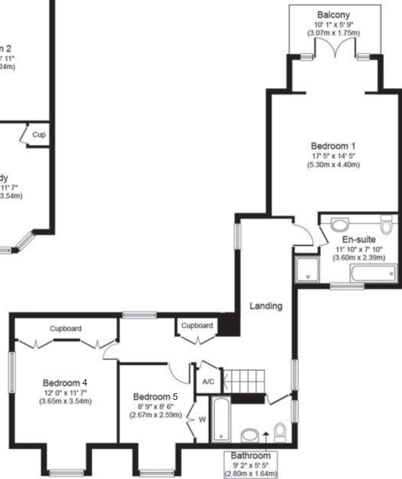
First Floor Approximate Floor Area 883 sq. ft. (82.0 sq. m.)