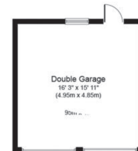
Garage Approximate Floor Area 258 sq. ft. (24.0 sq. m.)