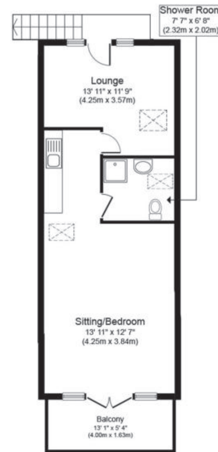
Boat House Annexe Approximate Floor Area 441 sq. ft. (41.0 sq. m.)